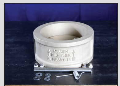
Check Valve Rebuilding