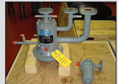
Overhauled Rotoflow Turboexpander