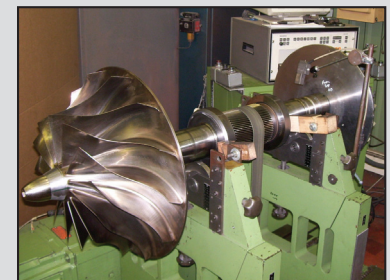
Joy Rotor In Balancer